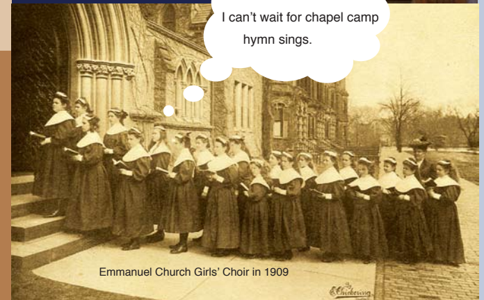
Emmanuel Church Girls' Choir in 1909

I can't wait for chapel camp hymn sings.